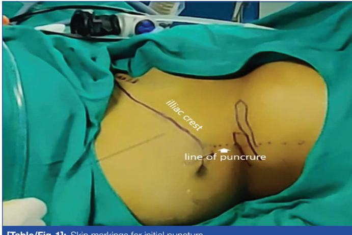
[Table/Fig-1]: Skin markings for initial puncture.

Positioning: After giving anaesthesia, patient was positioned in supine position with a bolster placed under ipsilateral scapula and rib cage (not extending below 10<sup>th</sup> rib). This bolster could be a silicone bolster or 500 mL intravenous fluid plastic bottle with average thickness of 3 inches. The purpose of putting the bolster under thorax was to bring lower pole of kidney at the level of highest point of iliac crest for calyceal puncture. The thickness and placement of the bolster is very important as a thicker bolster placed further down could lift the lower pole of kidney beyond the level of highest point of iliac crest and could also bring colon in the trajectory of puncture needle [Table/Fig-1].